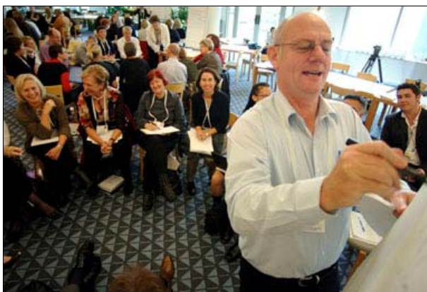
Stream Session - Strengthening Communities and Supporting Working Families

Participants in this stream also proposed specific ways of reducing the damage inflicted on communities by problem gambling and binge drinking. These could include reducing the number of poker machines or tighter regulation of alcohol.