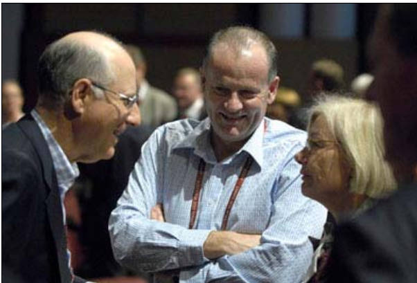
Stream Session - Future of the Australian Economy

This stream advocated a fundamental commitment to creating a seamless national economy and single national markets in major areas of economic activity (for example, labour, energy, water, transport and communications). The goal should be to minimise overlaps and bottlenecks and improve competitiveness. They will require clarification of roles, responsibilities and accountabilities between different levels of government. At present, however, Australia's economy in major markets is highly fragmented: the COAG national reform process has identified more than 25 areas in which Australia has eight sets of different State and Territory regulations. In addition, we have multiple education and accreditation systems. A country of Australia's size cannot afford this.