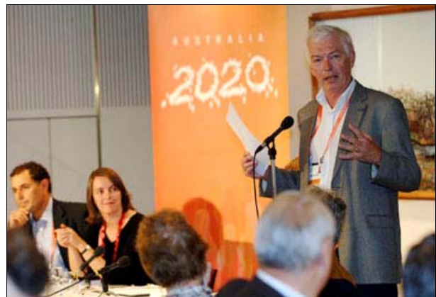
Stream Session - A Long-term National Health Strategy

This stream was characterised by five key themes. Participants stressed the importance of healthy lifestyles, health promotion and disease prevention. A related theme was the need to address health inequalities (including lifestyle factors) within and across communities. The health workforce and service provision were seen as key enablers for a healthy population. Much discussion centred on the future challenges and opportunities in health – and the role of health research, research translation and research training in addressing these.