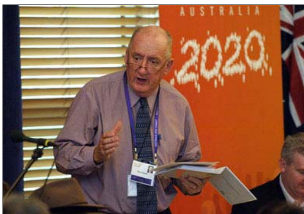
Stream Session - Future Directions for Rural Industries and Communities