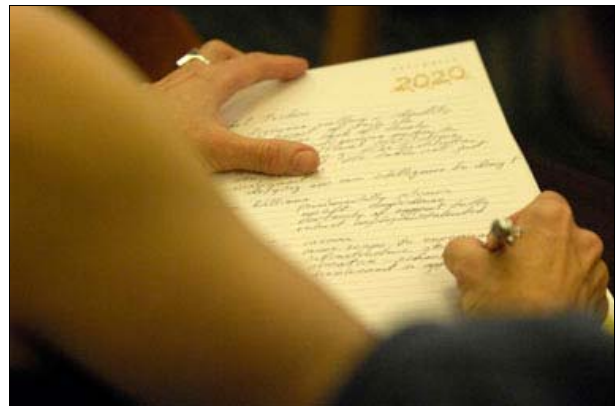
Stream Session - Towards a Creative Australia

Other major topics included government support, television content, accessibility and design.