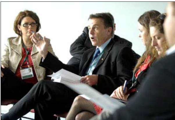
Stream Session - Australian Governance

Another major theme was the need to strengthen the participation of Australians in their governance: a revolution in community and government interaction through grassroots and non-traditional community engagement, as well as more formal electoral processes.