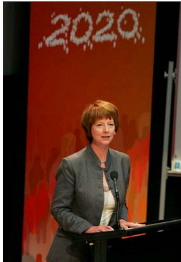
Stream Session - Future of the Australian Economy

The submissions also highlighted the need to attract and retain talented, creative and highly skilled people (including researchers and scientists, entrepreneurs and professional skilled workers) in the context of the global 'war for talent'.