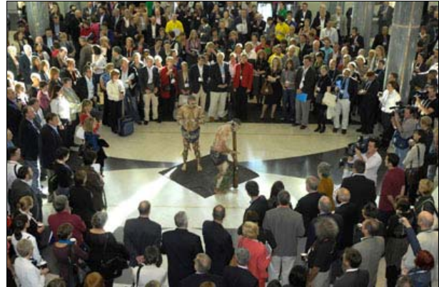
Participants Arrival and Welcome

There is a sense of a nation at a significant point in history, where shifting global balances of economic power will affect Australia's place in the world. There is a great opportunity in the shift of economic power to Asia and the Pacific – provided we use our geography, economy and cultural resources to create and nurture profound links.