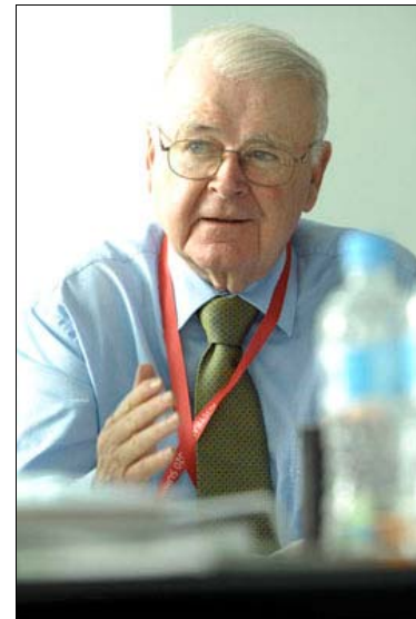
Stream Session - The Future of Australian Governance

Another major theme was the human rights agenda – with many submissions supporting an Australian Bill or Charter of Rights either in the Constitution or in legislation. This included discussion of legal reform (e.g. legal enshrinement of basic freedoms) and structural safeguards (such as government review mechanisms and a fair and transparent justice system). Many submissions stressed the need to continue vigorously supporting the role of women and Indigenous people in Australian governance.