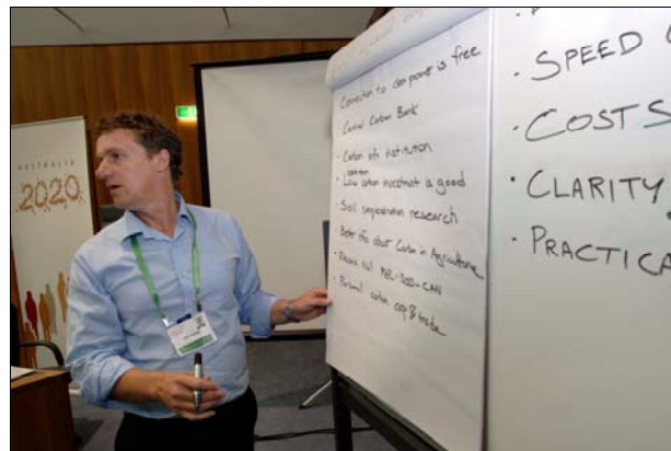
Stream Session - Population, Sustainability, Climate change, Water and the Future of our Cities

By 2020 the health of Australia's ecological systems will be improved. The health of our river and groundwater systems will be managed to achieve ecological sustainability, supporting food and fibre production and resilient communities. Australia will also have become a global leader in tropical water system conservation and sustainability.