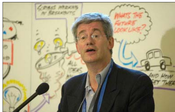
Stream Session - Towards a Creative Australia

The stream also discussed the increasing importance of creativity in the new economy, both at home and abroad. This is central to innovation in the new industries which are fuelled by creativity and draw on the arts, entertainment and design. This will present both opportunities and challenges as traditional models of income support change. Success in this new environment demands that creativity is embedded in our education systems, economy and international representation at every level.