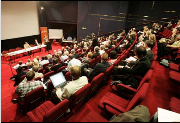
Stream Session - The productivity agenda - education, skills, training, science and innovation

Higher levels of information and globalisation create unprecedented opportunities to increase productivity growth. Productivity growth requires excellent social and physical infrastructure, flexible, fair and equitable labour markets, and a world leading education and innovation system.