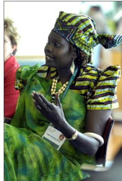
Stream Session - Australia's Future in the Region and the World

Some submissions suggested that Australia should adopt a more neutral foreign policy posture. A substantial number of submissions emphasised the importance of developing more intensive links with China and India. Several submissions made the point that diplomacy, peacekeeping, engagement with civil society and the development of international norms, principles and rules were more relevant to Australia's security in the future than the use of military power.