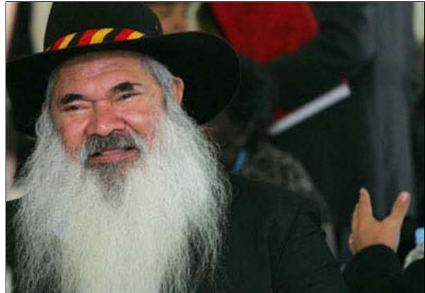
Stream Session - Options for the Future of Indigenous Australia

There was wide support for new, independent mechanisms with teeth and sanctions to monitor accountability of governments, involving significant Aboriginal and Torres Strait Islander representation.