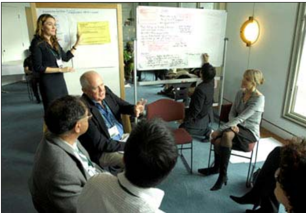
Stream Session - Australia's Future in the Region and the World